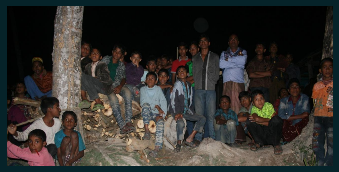
On 15 evenings two documentaries about the freshwater dolphins and ongoing conservation research were seen by a total of 4463 people.