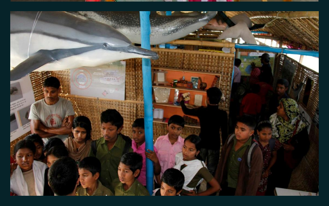
The Shushuk Mela 2013 was open to the public for 24 days.