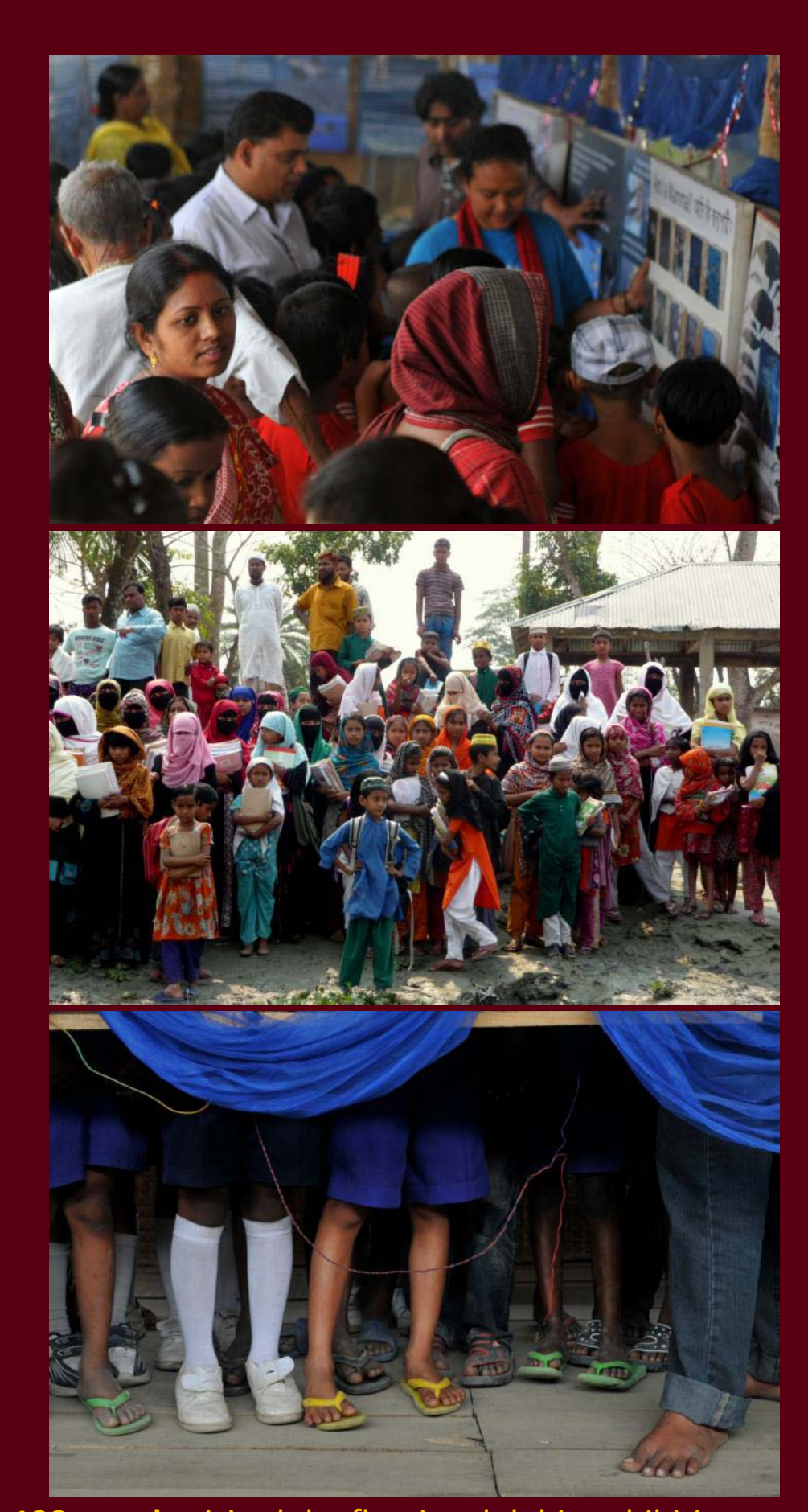
A total of 19,128 people visited the floating dolphin exhibition. 55% were under the age of 16, 28% between 17 to 40 years of age.