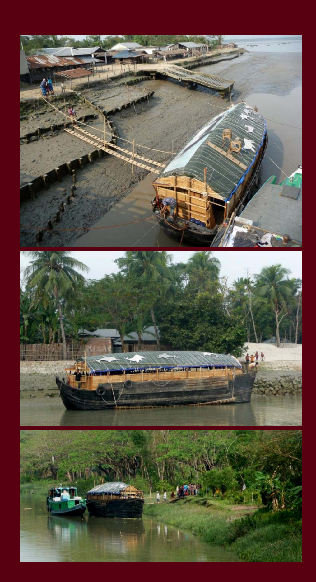
A traditional palm leaf harvesting barge was modified into a floating information center.