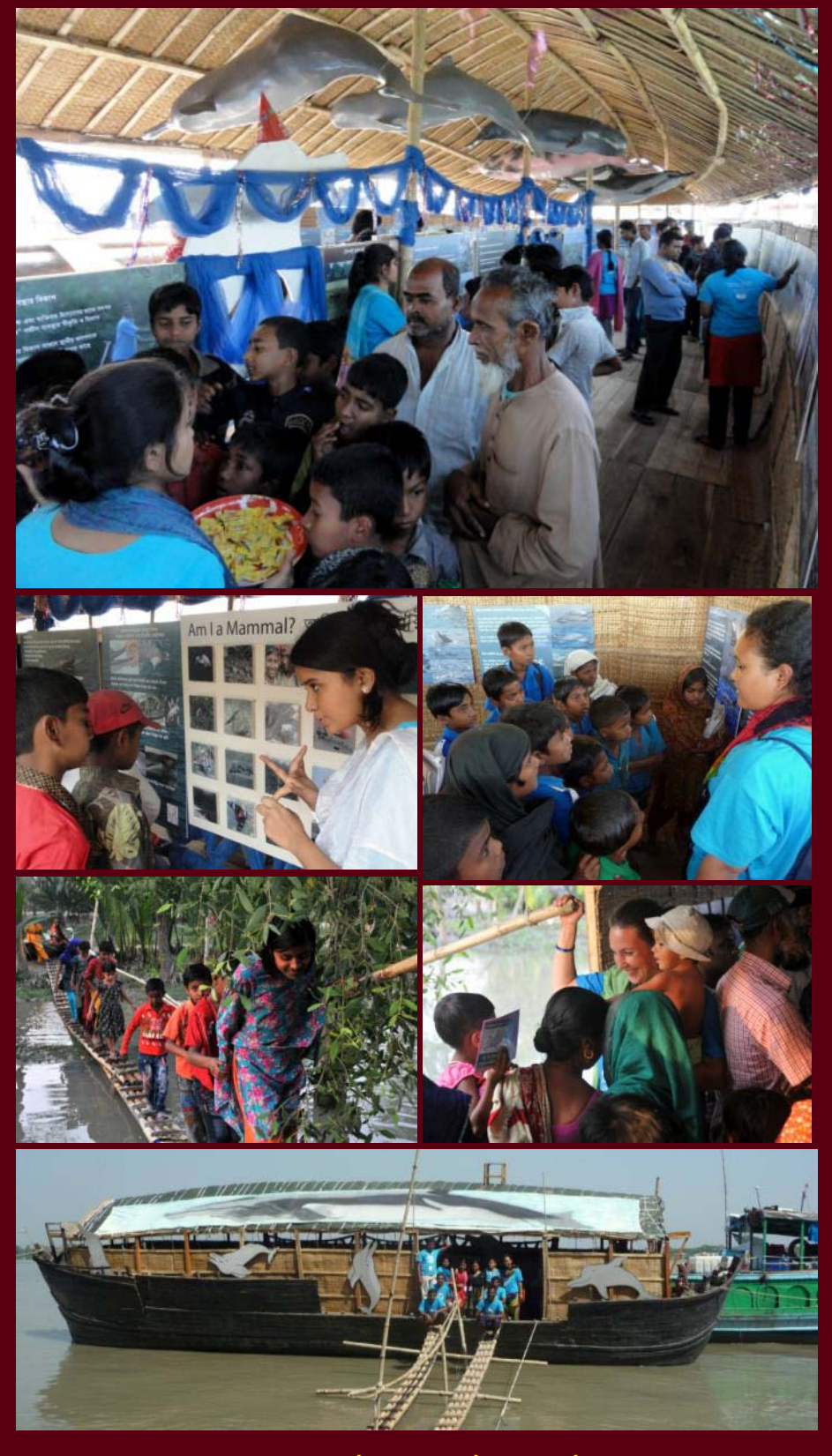
On an average 736 guests were welcomed per day.

Visitors were guided through the exhibit by a team of 2-3 WCS staff and 5-7 volunteer interpreters.